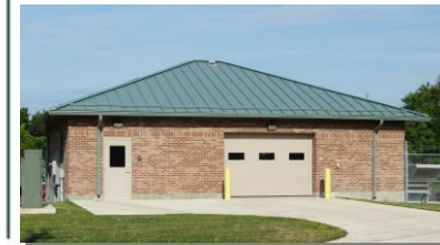
The Main Lift pump station is located at the old plant site on 12 th Avenue. All collections are pumped from this location to the facility west of the city.